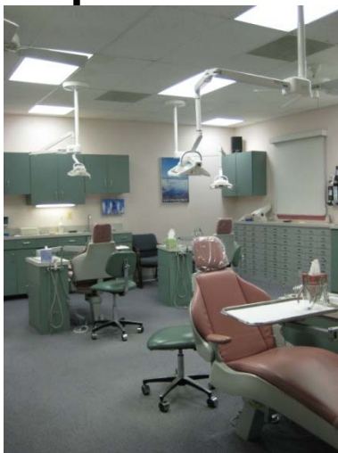
BEFORE: treatment area