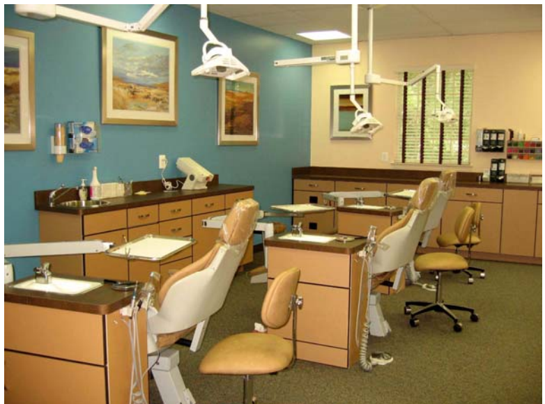
AFTER: treatment area