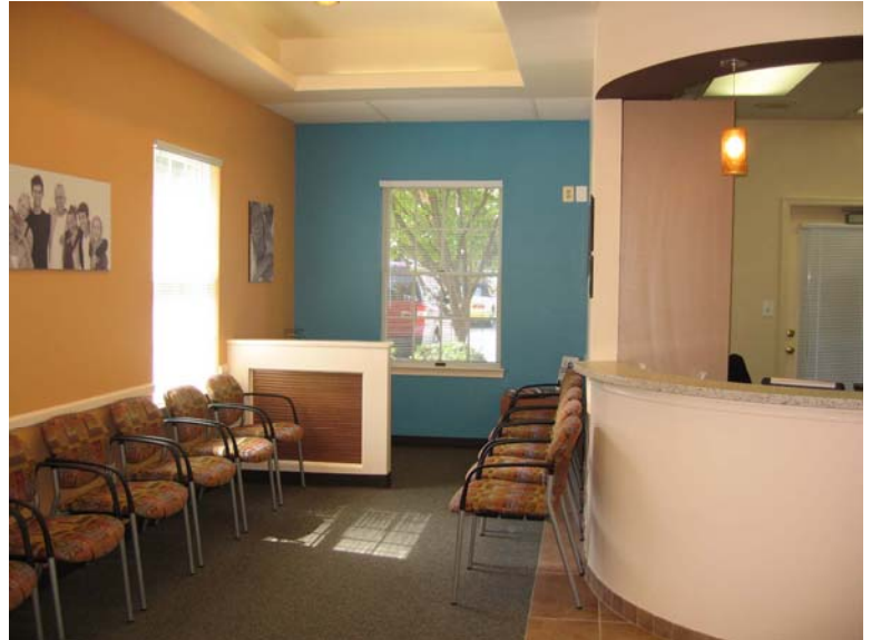
AFTER: reception area